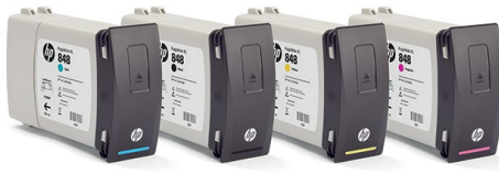
8 HP PageWide XL ink cartridges (2 x 400-ml per color with auto-switch)

The HP PageWide XL 5000 Printer series includes a stationary 40-inch (101.6-cm) printbar that spans the whole printing width. As paper moves under the printbar, the entire page is printed in one pass, enabling very high printing speeds.